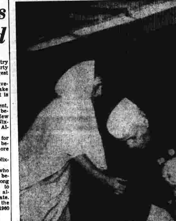
This picture was taken Tuesday when Indian Premier Jawaharlal Nehru, 74, center, was taken ill at the annual conference of his Congress Party in Bhubaneswar, India. His daughter, Mrs. Indira Gandhi, and an unidentified aide help him.

By JULES LON NEW YORK (AP)—Richard M. Nixon, apparently detecting growing sentiment that he should run again for president, says he is "willing to do everything necessary to see if the Republicans nominate their most popular and best-qualified man this fall." He insists there has been no change in his position that he is not a candidate, but it was his first indication that events might put him in this year's race. "I will make any decisions in the future," he said in an interview, "based on my primary conviction that it is vital to get